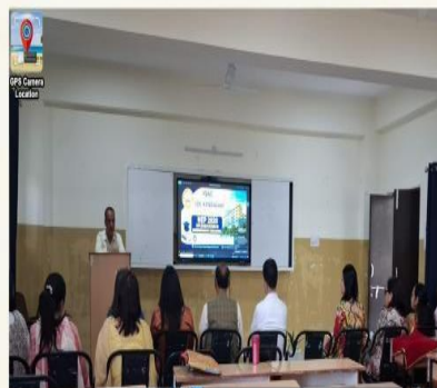
Kandaghat Himachal Pradesh India 25°C X484+93M, Kandaghat, Himachal Pradesh 173215, India