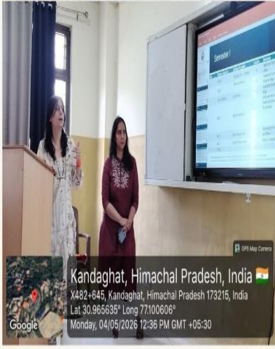
Kandaghat, Himachal Pradesh, India X482+645, Kandaghat, Himachal Pradesh 173215, India Lat 30.965635° Long 77.100606° Monday, 04/05/2026 12:36 PM GMT +05:30