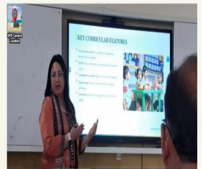
Kandaghat Himachal Pradesh India 25°C X482+645, Kandaghat, Himachal Pradesh 173215, India