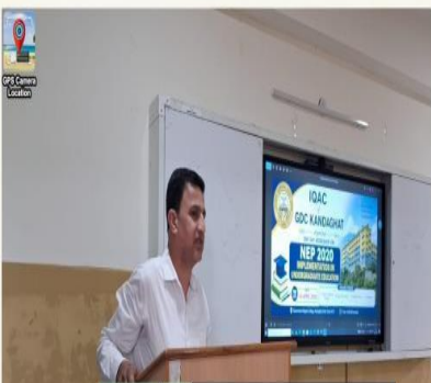
Baror Himachal Pradesh India 25°C X3JM+CQX, Baror, Himachal Pradesh 173215, India