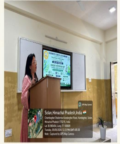
Solan, Himachal Pradesh, India Chandbaghat Shaikma Kandaghat Road, Kandaghat, Solan, Himachal Pradesh 173215, India Lat 30.965454, Long 77.100609 Tuesday, 05/05/2026 12:23 PM GMT+05:30 Note: Captured by GPS Map Camera