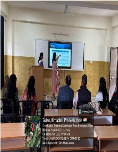
Solan, Himachal Pradesh, India Chandbaghat Shaikma Kandaghat Road, Kandaghat, Solan, Himachal Pradesh 173215, India Lat 30.965751, Long 77.100529 Tuesday, 05/05/2026 12:28 PM GMT+05:30 Note: Captured by GPS Map Camera