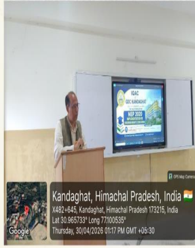
Kandaghat, Himachal Pradesh, India X482+645, Kandaghat, Himachal Pradesh 173215, India Lat 30.965733° Long 77.100535° Thursday, 30/04/2026 01:17 PM GMT +05:30